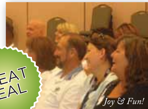
Joy & Fun!